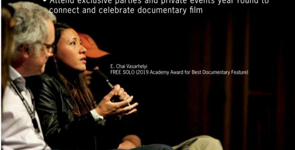
E. Chai Vasarhelyi FREE SOLO (2019 Academy Award for Best Documentary Feature)

“One of the world’s largest and most prestigious documentary festivals”