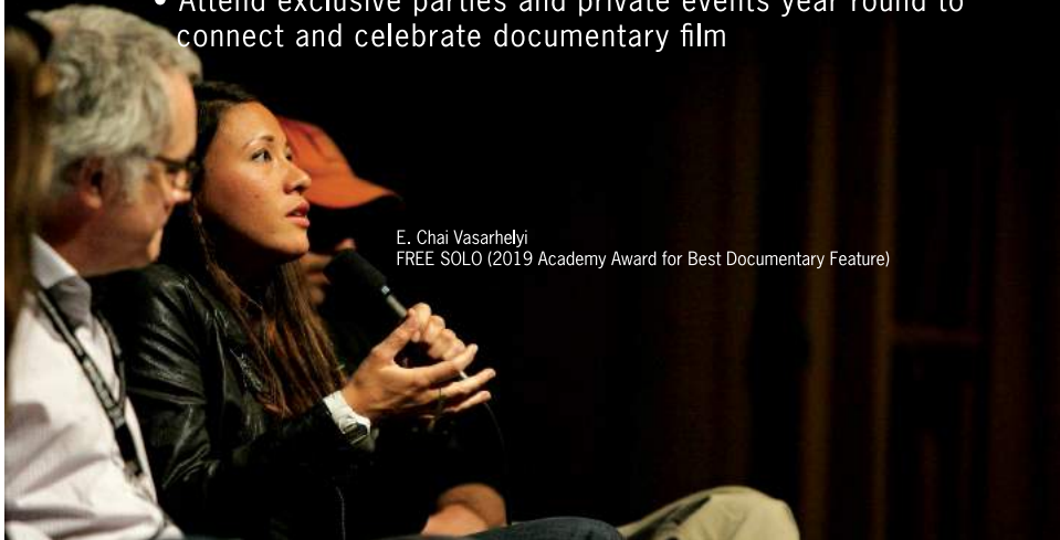
E. Chai Vasarhelyi FREE SOLO (2019 Academy Award for Best Documentary Feature)

“One of the world’s largest and most prestigious documentary festivals”